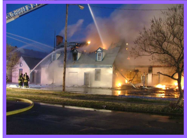
Wickham Avenue Fire